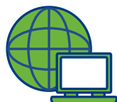
IT & NETWORK SECURITY